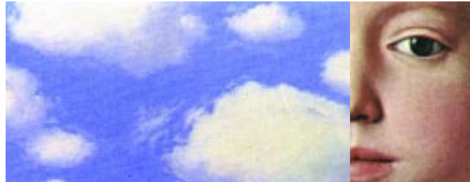
2004 crossing boundaries - conference logo