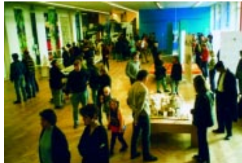
Stedelijk Museum, Amsterdam

Wednesady 25 February, 7 p.m. in the San Domenico Cloisters